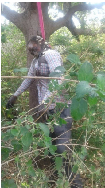
Figure 1. Crime scene image showing dead body hanging from a tree with an atypical knot over left side of the neck along with a right and down tilt. Putrefaction is established. Facial skin appears to be mummified.

Overall the scene had an impression of a classical hanging. A suicide note was recovered from back pocket of his pant, clearly stating his reasons for giving up life. The spouse confirmed of the personal possession of ligature by the deceased.